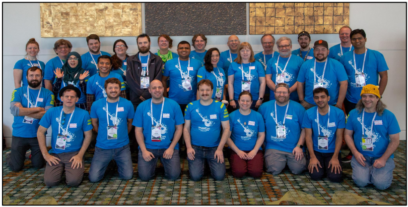
Traditional mentoring methods: DrupalCons Core Office Hours

More Contributors generally -and from under-represented groups